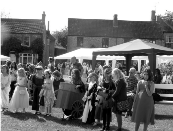
Fancy Dress Parade 2011

Children's Fancy Dress - 'Olympic theme'; 'Garden on a plate' and 'Design and make your own unique Olympic torch'; Photographic competition for adults and children – theme – 'Sport in action'. (Please write your name & phone number on the reverse). Any size print welcome! Details of these competitions were in the August edition of Meeting Point. We do hope as many of you as possible will be able to come to the Fayre and we look forward to seeing you on the Green.