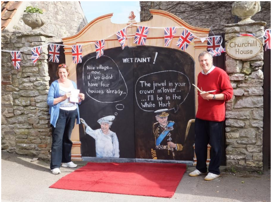
2012 Queen’s Diamond Jubilee: the winning entry of the decorated house competition

The biggest event of my time was The Queen’s Diamond Jubilee, for which preparations and celebrations seemed as extensive at a local level as at a national one. You can read a Jubilee round- up in July 2012 magazine.