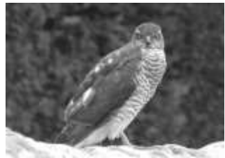
Sparrow hawk

Along the banks of the Severn you can find our smallest falcon which is the merlin; however, it is often a distance away across the open marsh and you really need a telescope. As winter approaches the number of birds will increase as the northern freeze will send them to us.