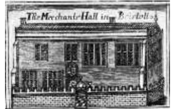
The original Merchants Hall in King Street

All are welcome. Come along on the night and pay for a single meeting or join for the year. There are seven talks this season, including this one. The rates will be decided at the brief AGM this evening but are likely to stay the same as, or rise to not much more than, last year's rates, which were £5 for annual membership, £2 for a single meeting. Definite value for money!