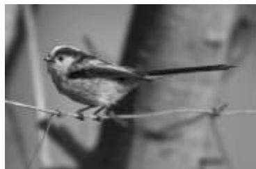
Long Tailed Tit

Finally, look for the long tailed tit which is an infrequent visitor to the bird table. This bird prefers to roam the hedgerows in families of around ten birds and so can be found during those long winter walks. Mostly black and white, with touches of brown, it's easily recognised by the colour and by its long tail. Often the first clue is its high pitched 'zsi-zsi-zsi' call. If you see one, look for the others for they are bound to be there. And, to repeat a tip from a more experienced birder, always look around below the long tailed tits as they provide excellent cover and warning for different small birds that prefer to skulk along undetected.