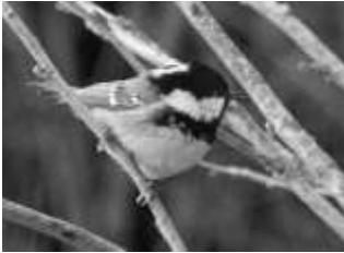
Coal Tit

The members of the tit family will become frequent visitors if you care to put food out. The two commonest are the blue tit and the great tit. Some have asked why the smaller of the two is called the blue tit when its body is yellow. You have to look at its head to see the sky blue markings. Interestingly the birds themselves can see ultra-violet light and so for them their heads shine as a mark of fitness and good health. The larger bird is the great tit which is identified by the black stripe that extends down the breast. Males and females can be told apart by the bolder, broader stripe in the males whereas in the females the stripe is less well defined and thinner.