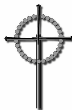
St Mary's, Olveston