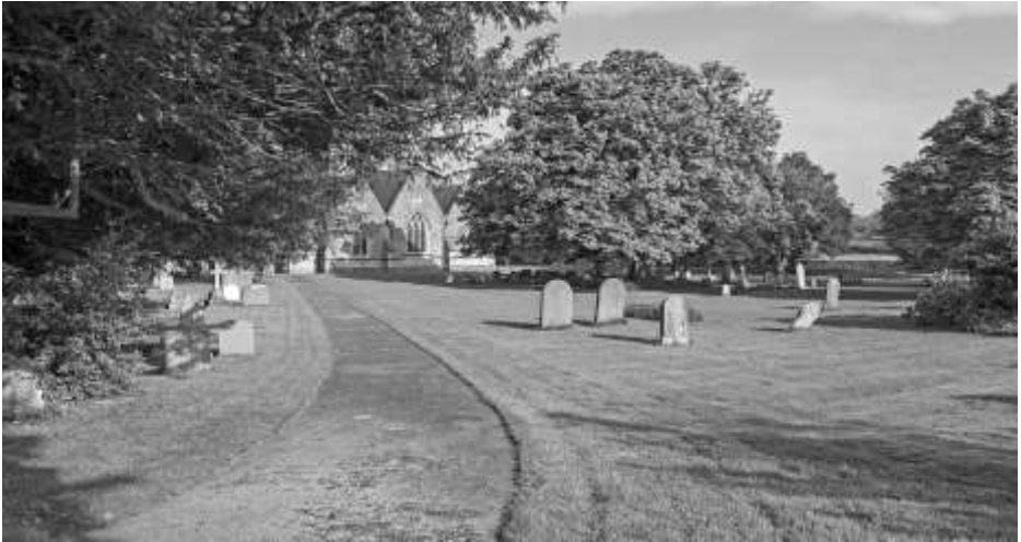
Elberton Church Grounds

Come and join us for a cream tea, tombola, cakes, draw, skittles, etc And enjoy looking at the work of local artists, displayed in our church.