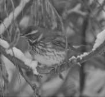
Redwing

As winter bites into the New Year, spare a thought for those birds that have flown in from the north to enjoy our milder climate. Our native bird populations will swell with many millions of birds and at this time of year two thrushes in particular are worth looking out and listening for.