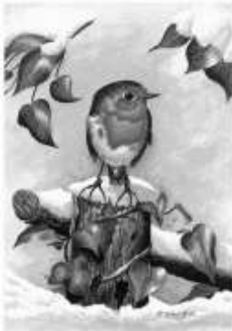
Robin