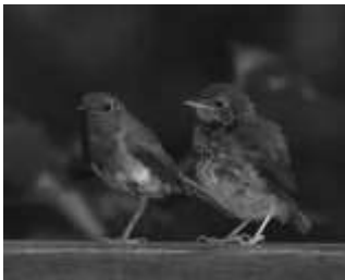
Robin with young

Their nesting habits are famous for the variety of