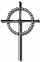
St Mary's, Olveston

If you are interested, put the date in your diary and look out for more details – including how to find the field – in next month's Meeting Point.